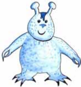
Lou the Blue Monster