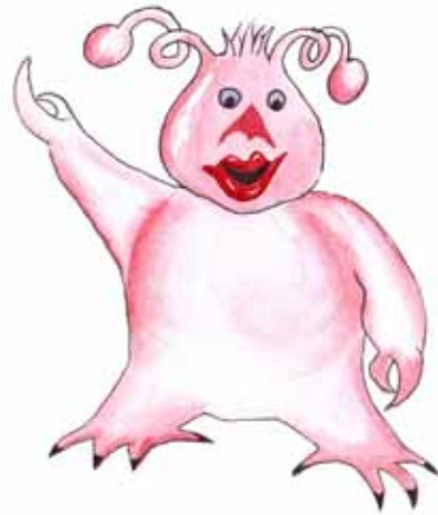
Lippy the Slippery Monster