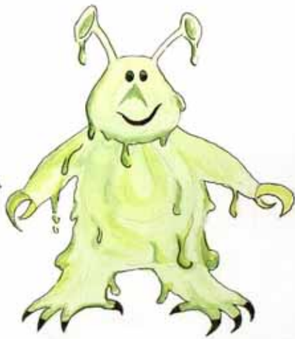
Lime the Slime Monster