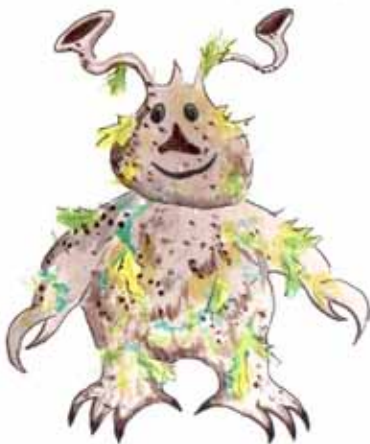
Rhyme the Grime Monster