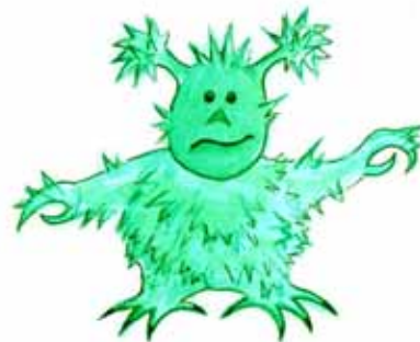
Reen the Green Monster